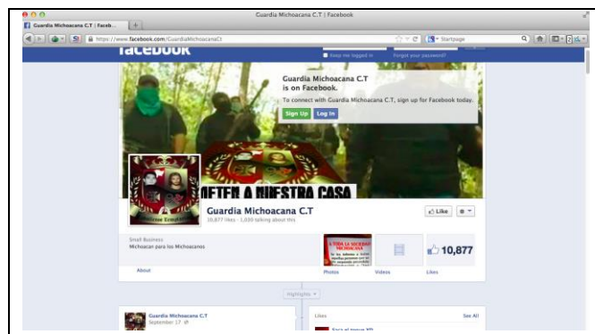
Figure 2. Screenshot of the Knights Templars’s Facebook profile.

The Cartels’ have also taken advantage of more traditional methodologies to distribute propaganda across different areas of operations, which to a great degree are parallel to practices employed by modern conventional forces including face to face communication; the use of print and visual, media; and the distribution of goods with the purpose of shaping the cognitive dimension of the human battlespace. For instance, throughout the country media sources have reported the frequent use of narco-mantas , which are propaganda