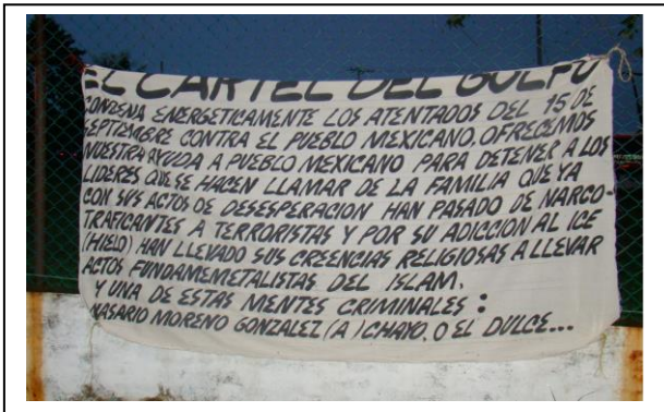
Figure 3. Example of a narco-manta placed in Tabasco, Mexico in 2008.

as El Día del Niño (Children’s Day), where the VNSA brings “music, fireworks, free toys and sweets, clowns, wrestling” and even “notes of good wishes” from the organizations’ leaders [38]. In these instances the Cartel exploits the hyper-exposure that it is offered by web applications in order to maximize the range and effects of PSYOPS being conducted.